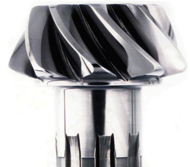
After the ISF® Process