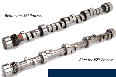
After the ISF ® Process