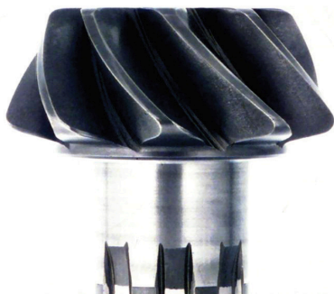
Before the ISF® Process